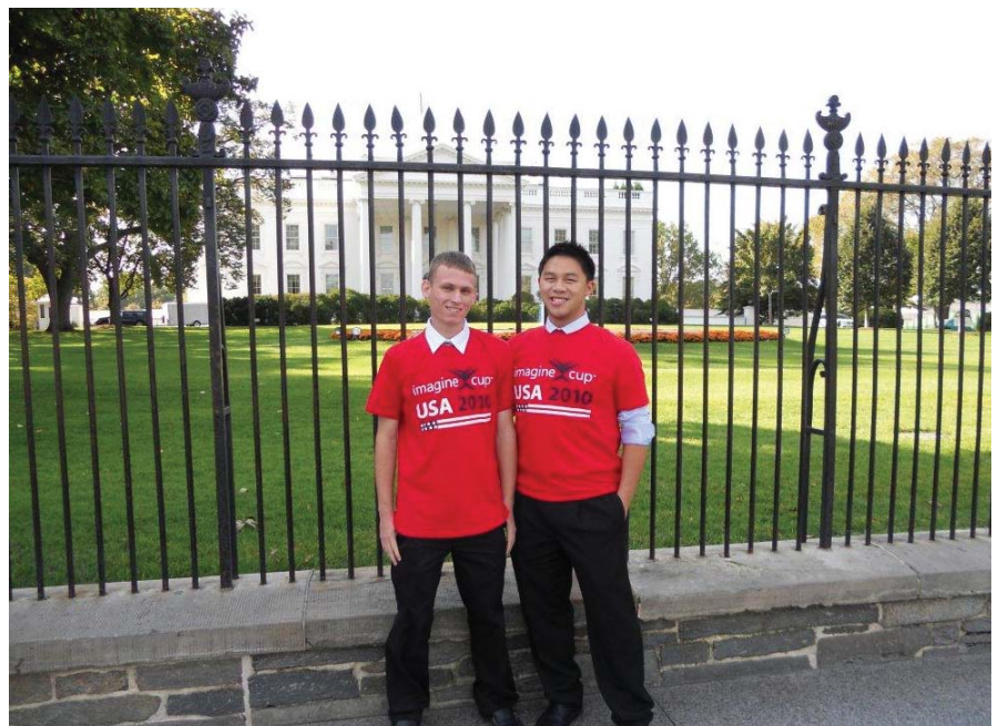
The Imagine Cup takes you to great places...

The Imagine Cup is a way for students to use creativity, imagination, and brainpower to open up a world of opportunities after graduation. And for you to make a name for yourself in the world of technology. Some past competitors have gone on to secure a great internship or the perfect job, while others have started their own companies based on their Imagine Cup project and it's all in the name of helping to solve the toughest problems using technology.